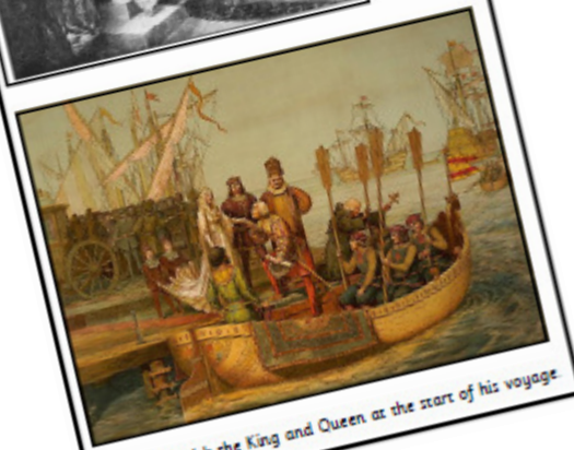
Columbus with the King and Queen at the start of his voyage.