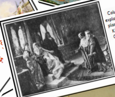
Columbus explaining his plans to the King and Queen of Spain.