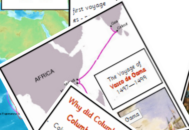
The Voyage of Vasco da Gama 1497—1499

Why did Columbus make his voyage? Columbus had personal reasons. Columbus came from ordinary, humble origins. He wanted to better himself.