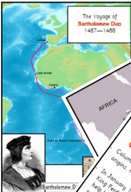
The Voyage of Bartholomew Dias 1487—1488

Portugal had been given permission by the Pope to explore all lands south of the Canary Islands. To the Portuguese, this meant looking for a route to the Indies via the coast of Africa. The navigator Bartholomew Dias reached what he thought was the southern-most point of Africa in 1488 and, in 1498, Vasco da Gama reached India via Dias' route.